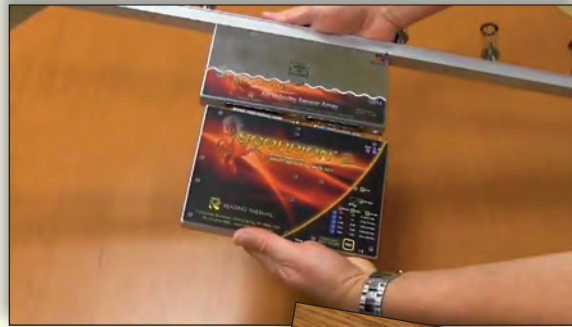
Visual Handouts for Note Taking